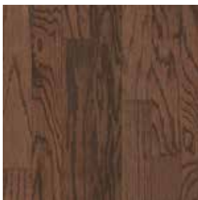
Saddle ECKES33L405 3"