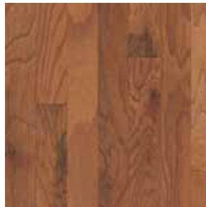
Butterscotch ECKES33L402 3"