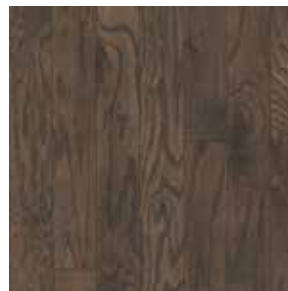
Gray ECKES33L407 3"