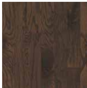
Mocha ECKES33L406 3"