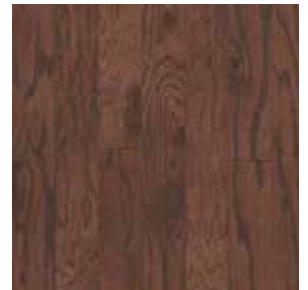
Cherry ECKES33L404 3"