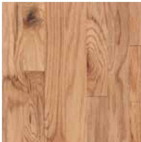
Natural ECKES33L401 3"